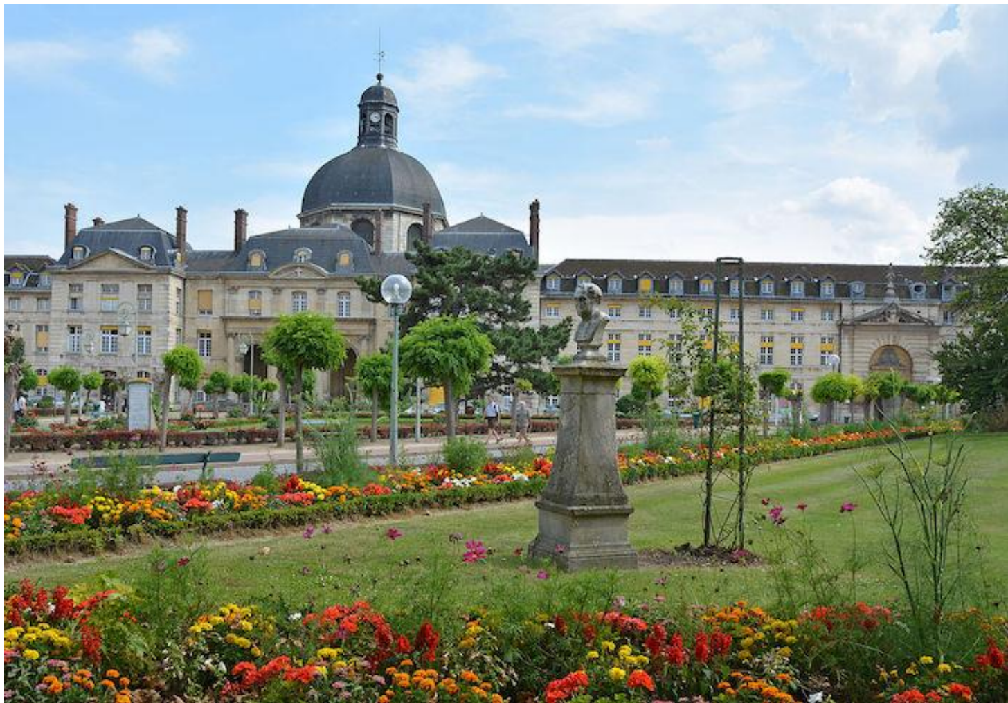
Pitié Salpêtrière Hospital