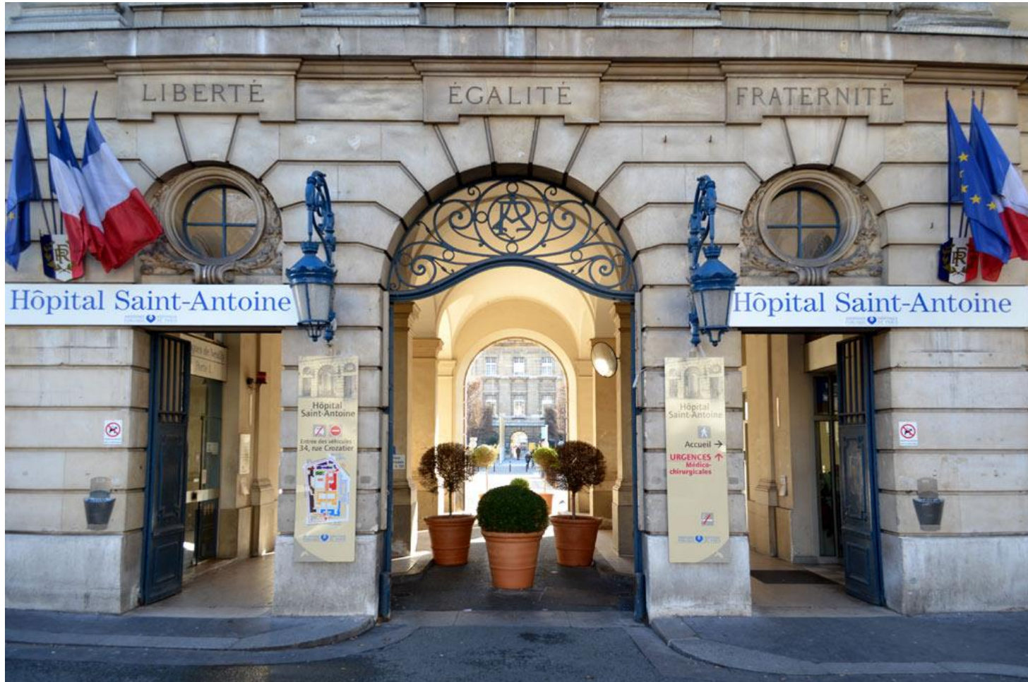
Saint Antoine Hospital