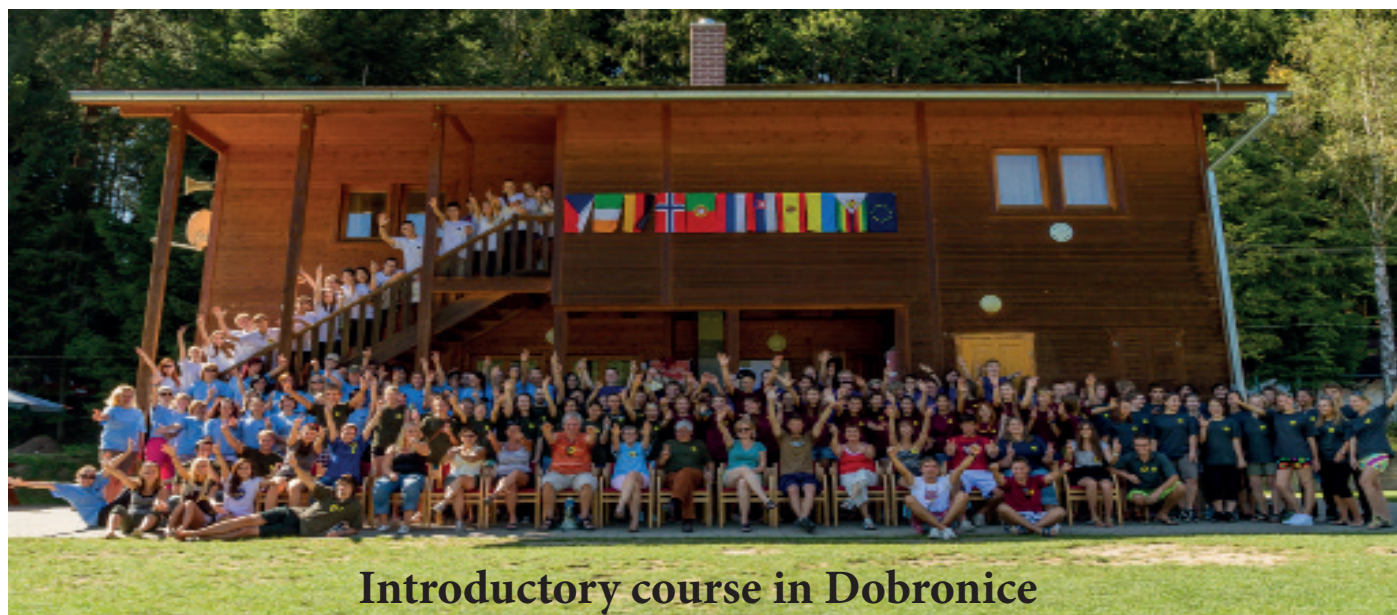
Introductory course in Dobronice